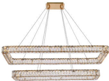
Satin Gold Item No:3504G50L2G