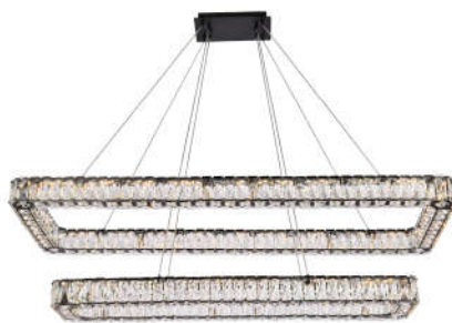
Black Item No:3504G50L2BK